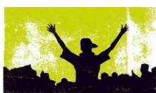
PRODUCTS Edgware unveils live 'big'