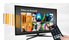
PRODUCTS Nagra to showcase smart