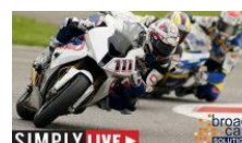
PRODUCTS Broadcast Solutions to